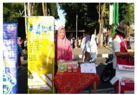
Fig.11: Sales and car-free day