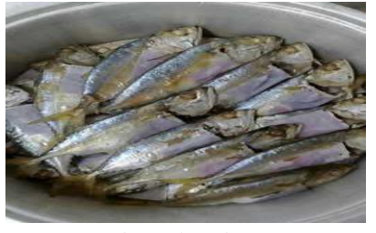
Fig.1: Sardine Already Presto

1. Put all Sardines into prestountil they get soft and then pour the seasoning.