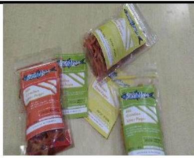
Fig.6: Product Label Stick Already Given