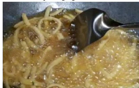
Fig.4: Stick Frying Process

4. Fry the dough,afterit is cut into pieces, using a medium heat until it turns golden brown. After that, drain it and do packaging