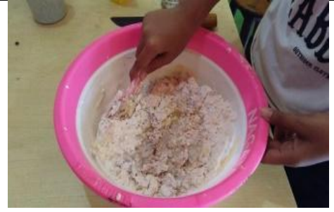
Fig.2: The batter is well-blended