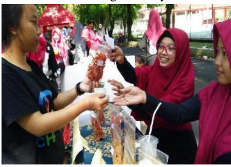
Fig.10: Sales Events Bazar

Sales stand was also opened at bazar and car-free-day events to increase sales and gain many consumers.