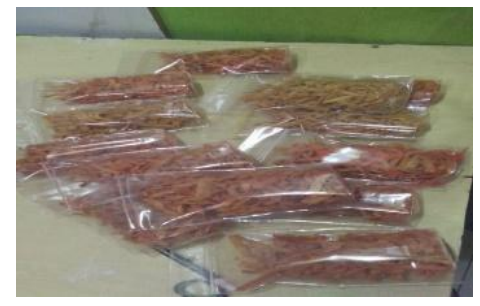
Fig.5: Packaging session

5. After all sticks are packed, then product labelling can begin. This product label serves as the product identity.