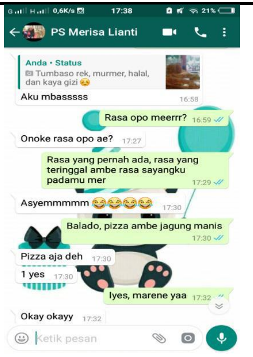
Fig.8: WhatsApp ofBasa Sardine Sticks

Sales by using social media and accounts, such as Instagram, serve to provide information relating to the products offered. The information shows the advantages of the product. It aims to attract consumers' interest to increase product sales. The various information and consumers' comments are attached onto the product package to encourage the sellers and the buyers in improving the products as well as satisfactory services.